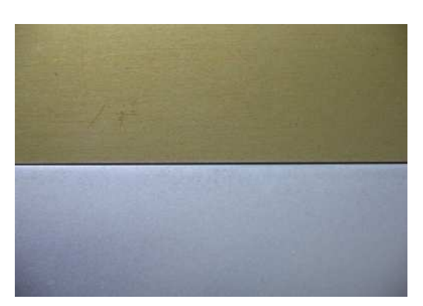
Above: Nanoceramic treatment Below: Untreated steel

Because it produces the characteristics of a coating (extremely thin, very large surface area), nanoceramic treatment yields better adhesion properties than zinc phosphating. No nanoparticles are present in either the as-received state or during processing. This eliminates any health risks posed by contamination, as the deposited layer is the only nanomaterial involved.