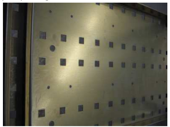
Production part after nanotreatment

Iron phosphating is a standard method for applying a conversion coating prior to applying a subsequent layer of paint. Adhesion and corrosion resistance are better on iron-phosphated surfaces than on surfaces that have merely been washed. While zinc phosphating improves the quality still further, it does have disadvantages: it involves the use of heavy metals, it is a complicated process, and it results in excessive sludge buildup. Nanoceramics, on the other hand, can be used for generating conversion coatings on steel, aluminum, and zinc with little difficulty. The process is environmentally safe (no heavy metals), requires only one bath setting, and protects against corrosion virtually as well as zinc phosphating.